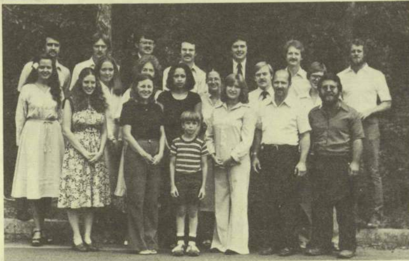
THE NEW WINE STAFF

We have been gradually adding new staff since our arrival in Mobile, and since you may have seen some unfamiliar names recently in the magazine or in our correspondence, we wanted to take this opportunity to introduce these new people and also give you a report on the regular staff at New Wine.