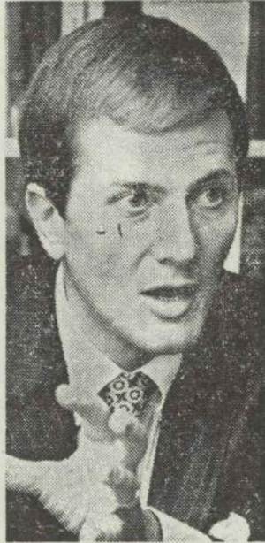
Pat Boone ... Jacksonville native

Boone, who still looks 10 years younger than his age of 35 despite the receding hairline in front, is convinced that a Christian television station can be successful because "we've got something going for us if we claim it, and that is the power of God. God will bless any ef-